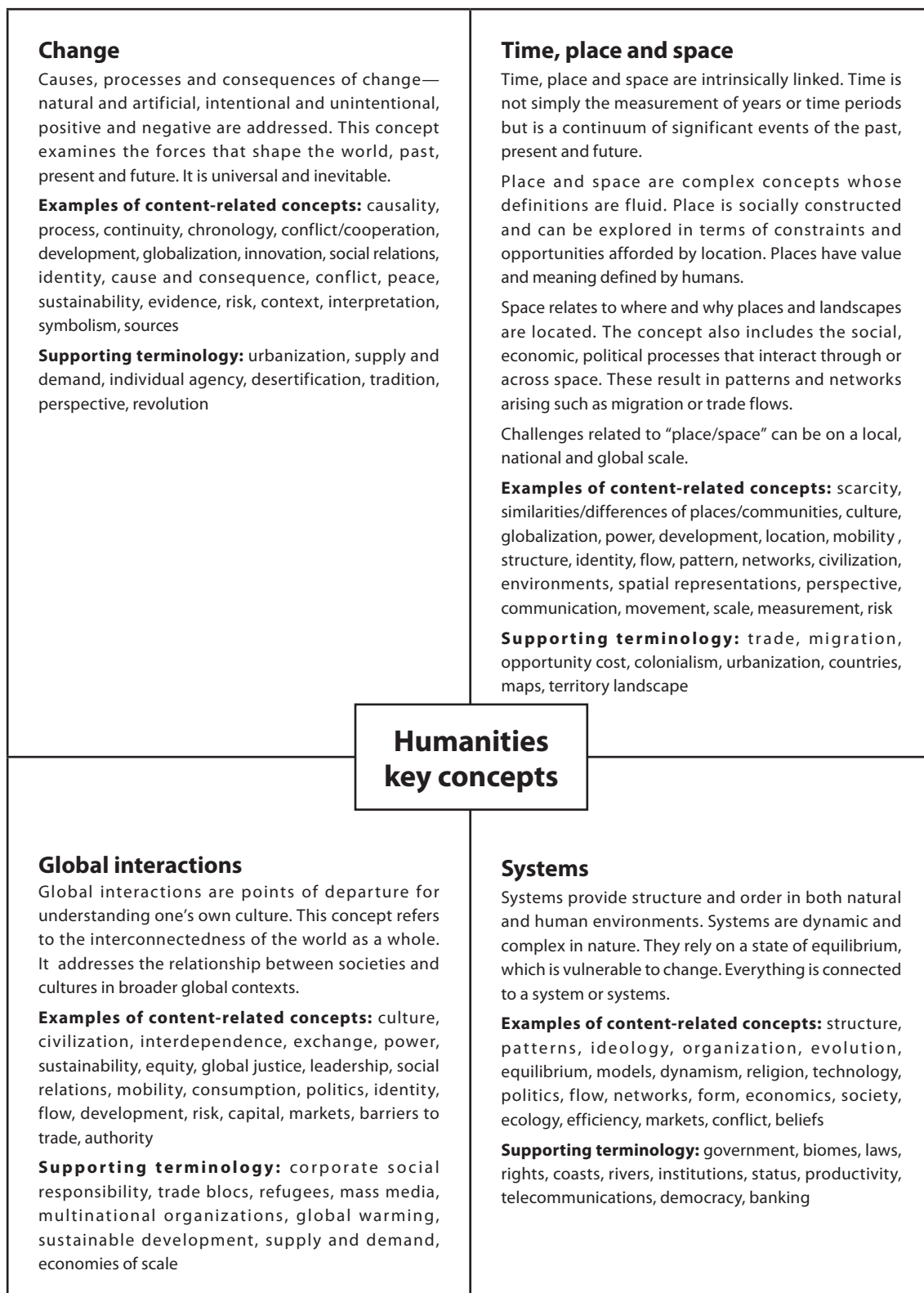
Figure 2 Humanities key concepts